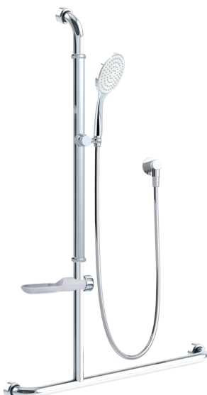
Drawn LH (Left Hand)