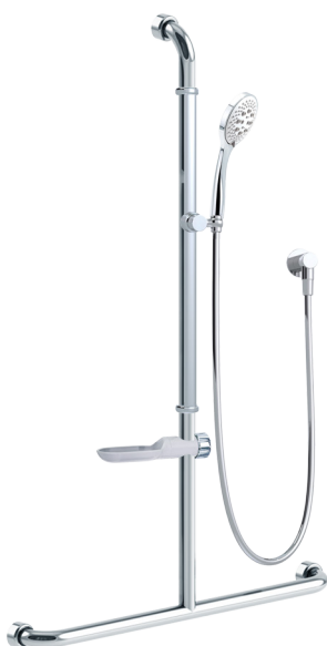
Drawn MF (Middle Fix)