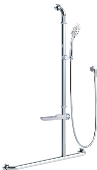
Drawn RH (Right Hand)