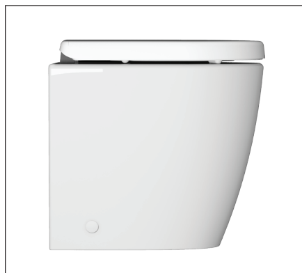
Pictured with Urbane Compact soft close seat

A classic designed wall faced concealed toilet suite comprises the Urbane Compact pan with short projection (460mm) and the trusted Caroma Invisi II cistern to suit small bathroom spaces in domestic and commercial projects. The smooth sided pan matched with the concealed cistern offer a seamless finish to your bathroom. Choose from a variety of buttons from the Caroma range to complete your desired look.